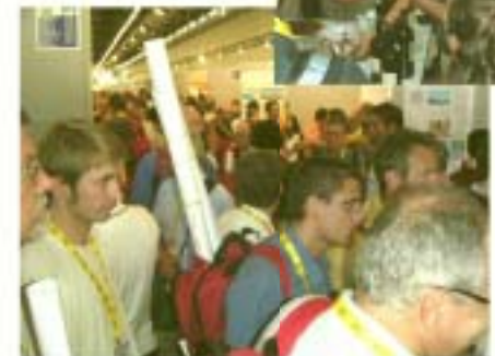
Special Poster (and sampling) Session