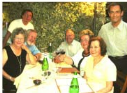
Enjoying Italian food and wine