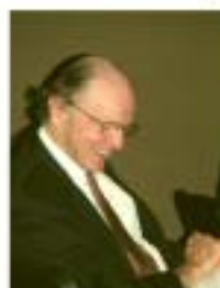
Jack is pleased