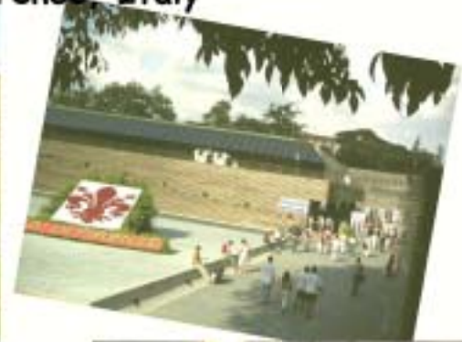
The old fortress - venue of the conference