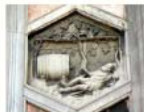
and at the end of the day ...