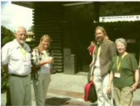
Old friends meeting again

The meeting gave plenty of opportunity to meet colleagues and old friends, as well as sample the culture and cuisine of the beautiful city of Florence.