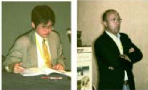
... and Math Geology talks