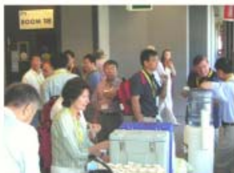
Coffee break at IAMG lecture room 18