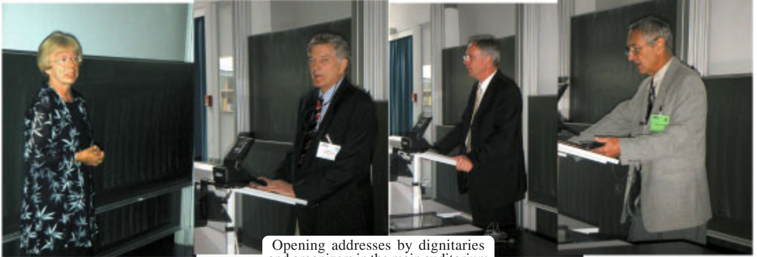
Opening addresses by dignitaries and organizers in the main auditorium