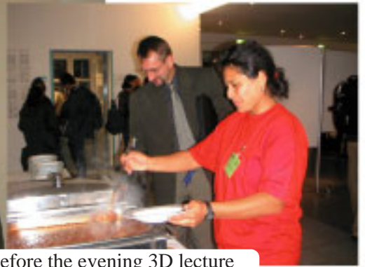
Goulash soup supper before the evening 3D lecture